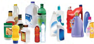
Plastic Bottles & Jugs