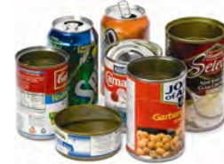
Aluminum & Steel Cans

Newspaper, magazines, "junk mail," office paper and paperboard boxes (cereal, tissue, etc.)