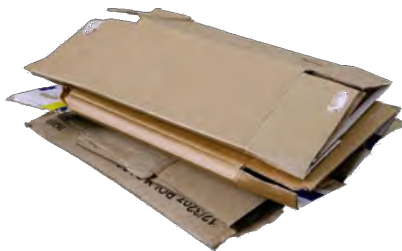
Cardboard (please flatten)