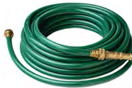
Hose or Wire