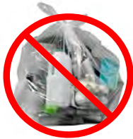
No plastic bags!