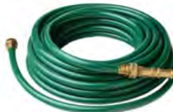
Hose or Wire